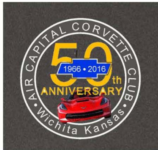
Enlarged pocket logo