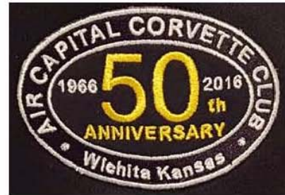
Patch for Hat/etc.