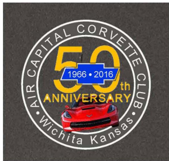
Enlarged pocket logo