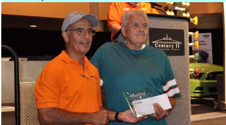
First In Class - BlackTop Nationals